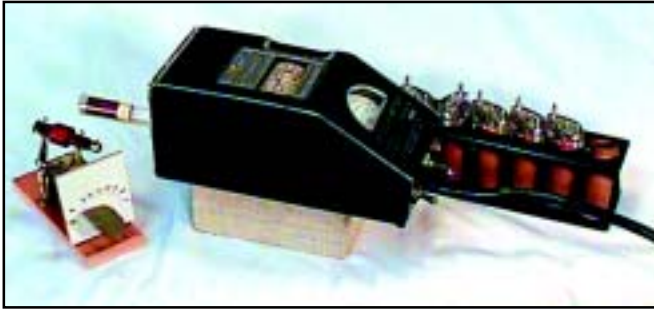
Figure 2—The dip meter's plug-in coil is aligned for inductive coupling with its axis parallel to the inductor of the resonant circuit.