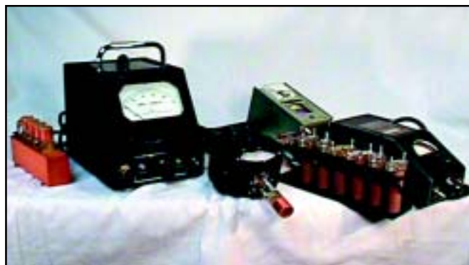
Figure 1—Several common types of dip meters are shown with their plug-in coils that determine the oscillator’s frequency.

Sometimes there is a switch to kill the oscillator to facilitate