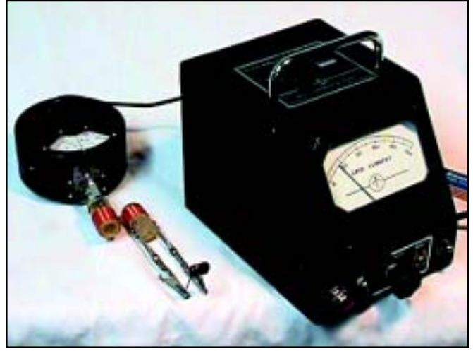
Figure 5—Tune the dip meter's frequency until the unit's meter reaches a minimum—or "dips." The plug-in coil is attached to the capacitor with slide-on alligator clips.

will reduce this error to acceptable levels. After the dip is found I decrease the coupling (move the two coils apart) and recheck the frequency of the dip.