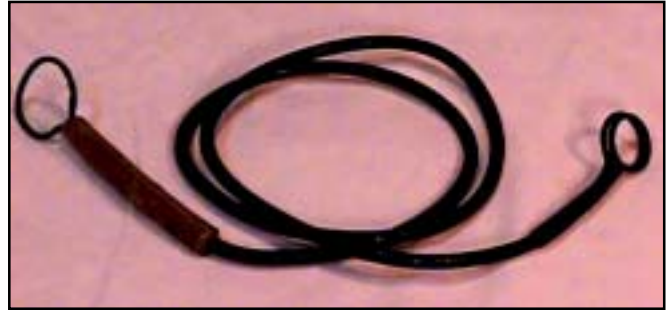
Figure 3—A coaxial cable "link" with a coil at each end is used to extend the reach of the dip meter's plug-in coil.