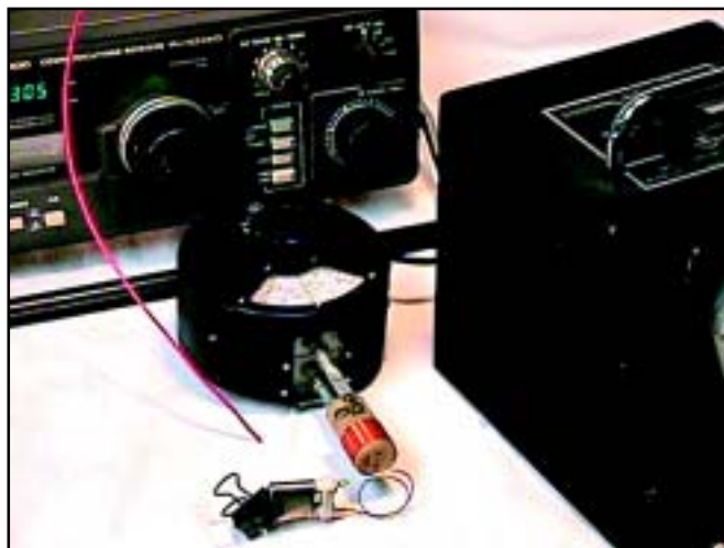
Figure 6—A calibrated receiver is used to monitor the dip meter's exact frequency while a crystal is "dipped."

The physical length of \frac{1}{4} wavelength of a coaxial cable